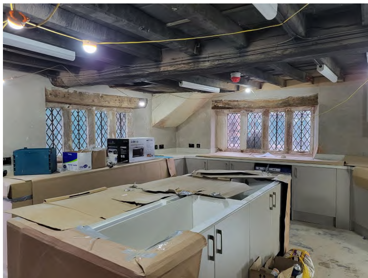
Figure 6: Kitchen Installation.