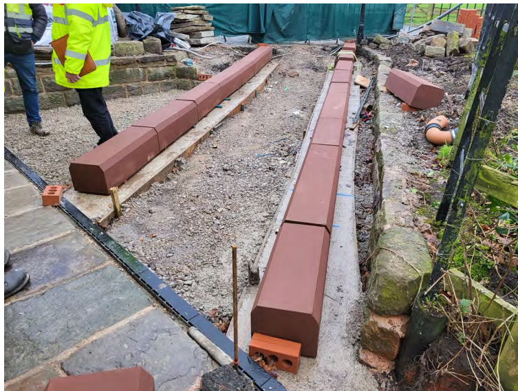
Figure 5: Red Sandstone Kerb.