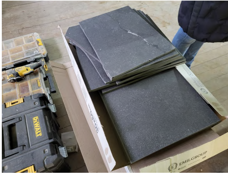
Figure 4: Porcelain Floor Tiles.