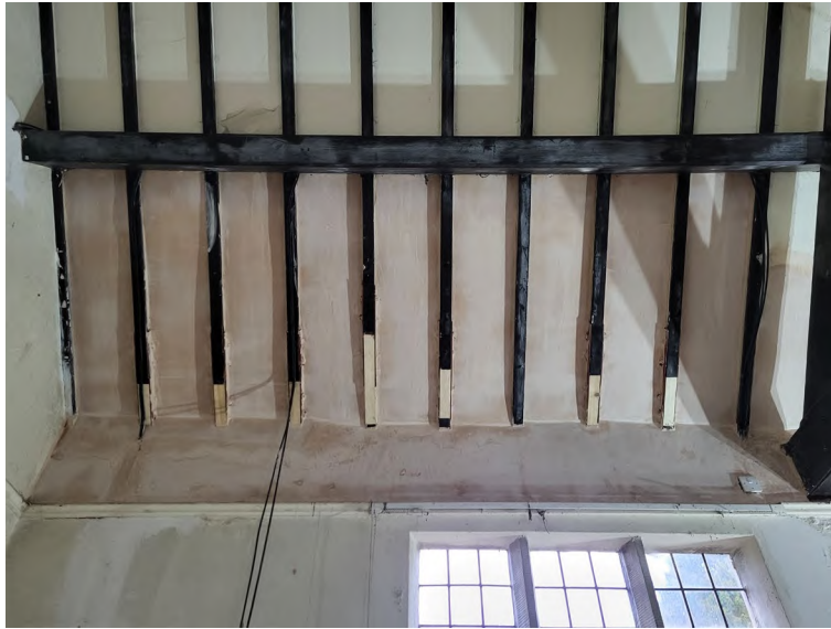
Figure 7: Rafter Repair Works to R 07.