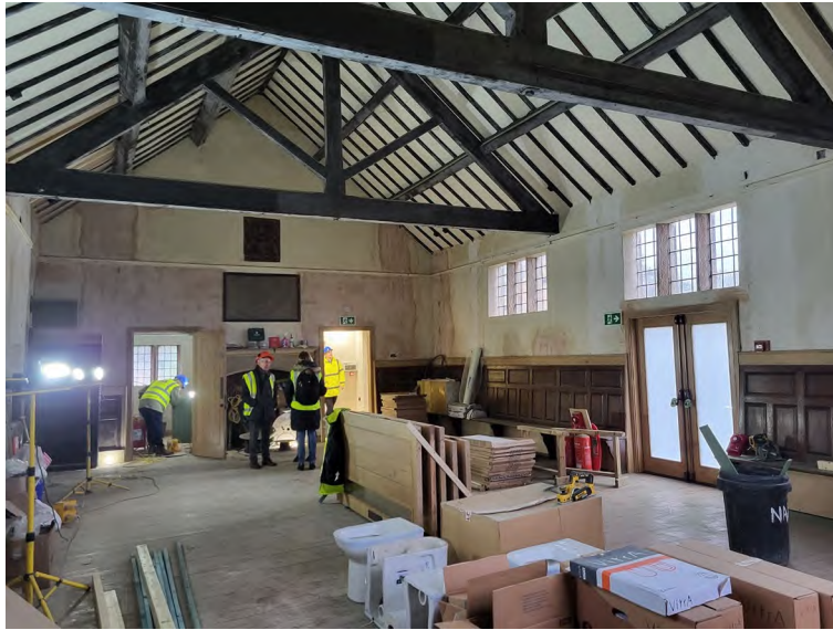
Figure 1: General View of Hall.