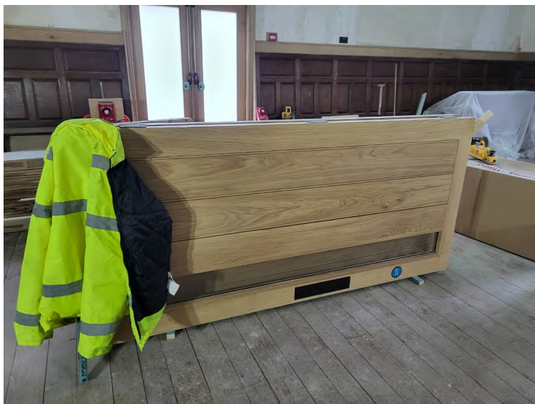
Figure 3: Internal Oak Doors.