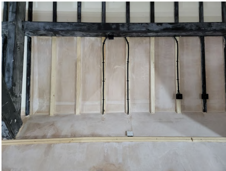
Figure 8: Rafter Repair Works to R 07.