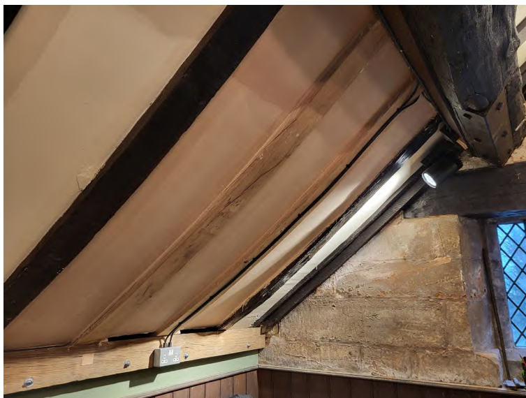
Figure 9: Rafter Repair Works to FR 01.