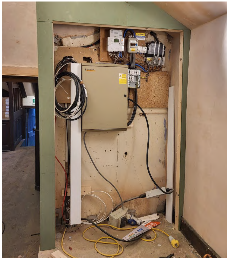
Figure 11: Electrical Cupboard.