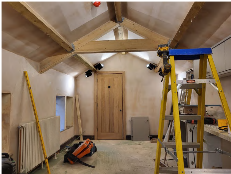
Figure 2: General View of First Floor.