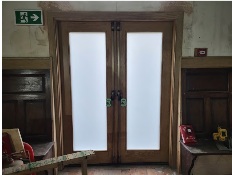
Figure 10: Door Furniture and Signage.