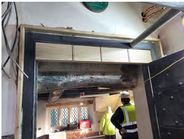
Figure 12: Joinery - Door DG 02.