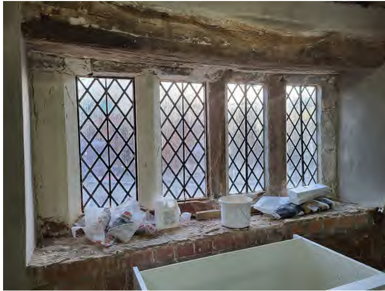
Figure 10: Existing Kitchen - Mullions to be Limewashed.