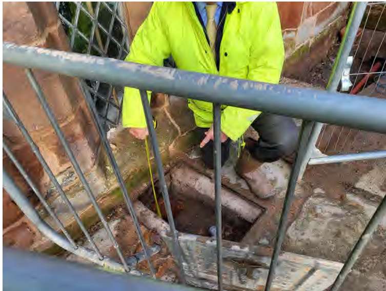
Figure 14: Drainage Works - Waste from Kitchen Reviewed.