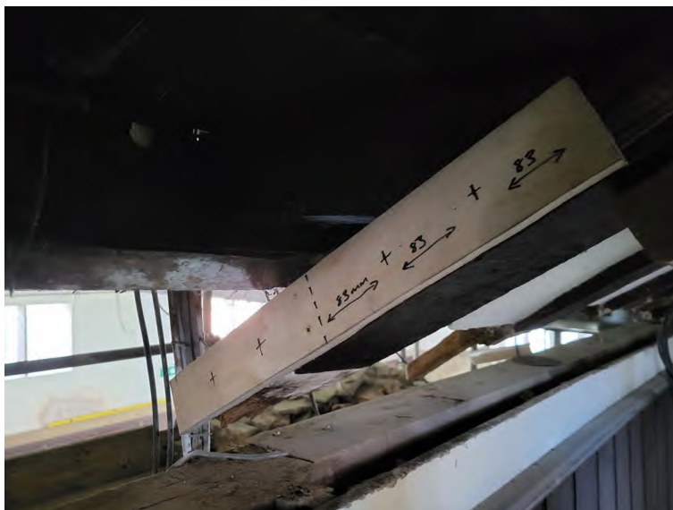
Figure 9: Timber Repair Works - Remedial Works to First Floor.