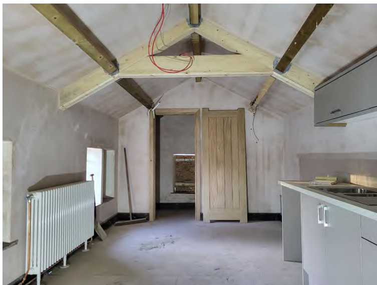
Figure 3: General View of First Floor.