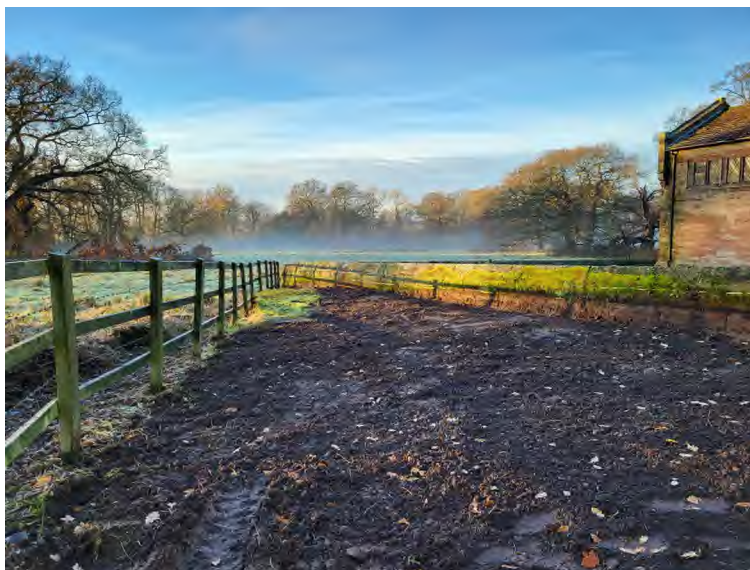
Figure 6: Landscaping - Triangular Section of Land Cleared.