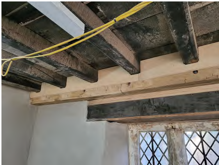
Figure 11: Existing Kitchen - Joinery to be Stained Dark.