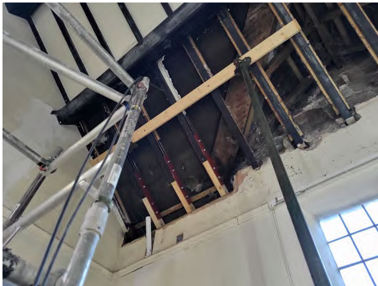
Figure 8: Timber Repair Works - Remedial Works to Main Hall.