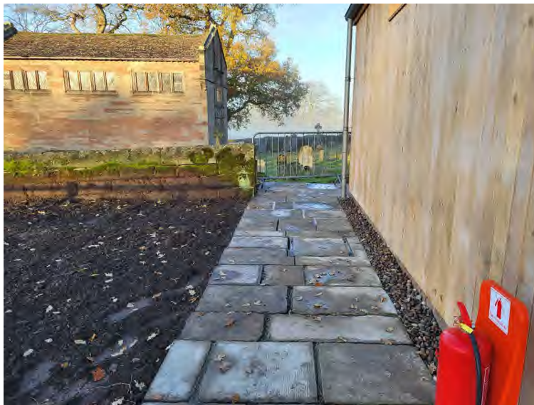
Figure 5: Landscaping - Stone Paving and Manhole Cover.