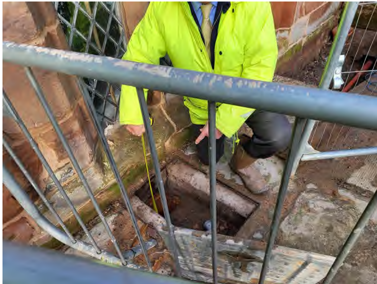
Figure 14: Drainage Works - Waste from Kitchen Reviewed.