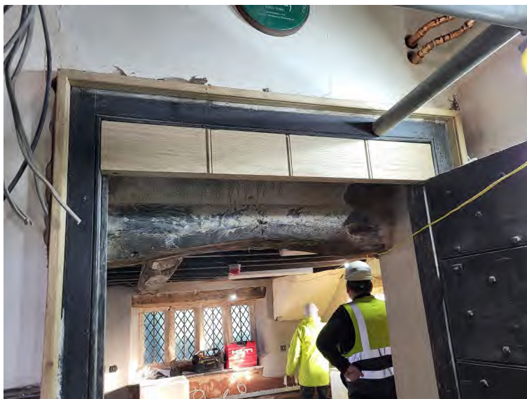
Figure 12: Joinery - Door DG 02.