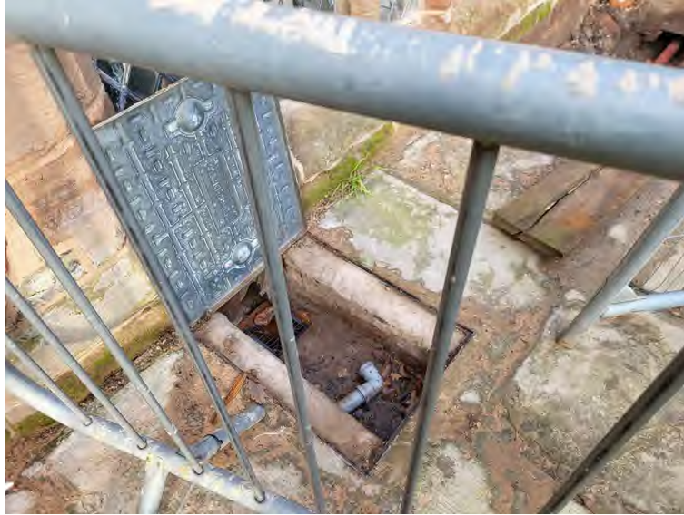
Figure 13: Drainage Works - Waste from Kitchen Reviewed.