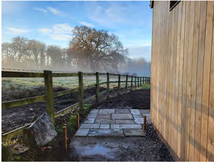
Figure 4: Landscaping - Stone Paving and Manhole Cover.