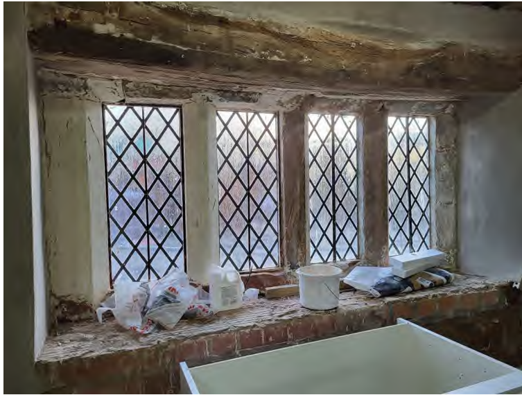
Figure 10: Existing Kitchen - Mullions to be Limewashed.