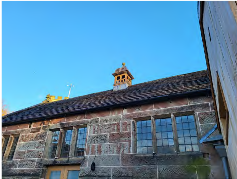
Figure 7: Completed Works to Bellcote.