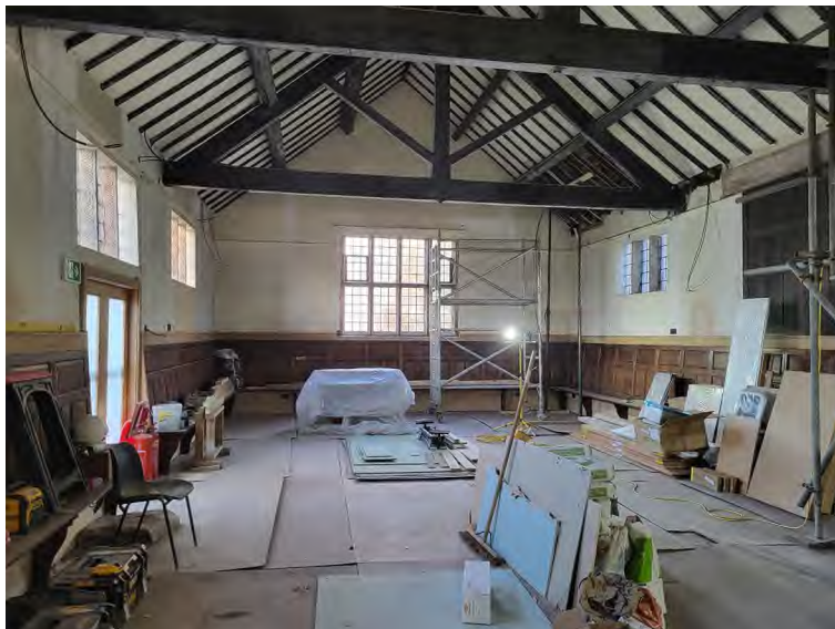
Figure 2: General View of Existing Hall.