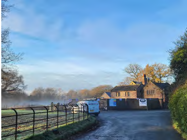
Figure 1: General View of Works.